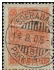
Cancel 141 # in lower segment