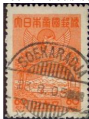
Cancel 145 xxx