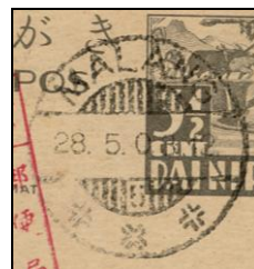
Cancel 146 # in lower segment