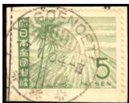
Cancel 140 xxx