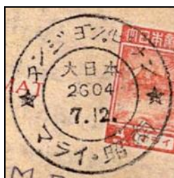
Cancel 258 Tandjong Pinang