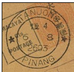
Cancel 250 Tandjong Pinang