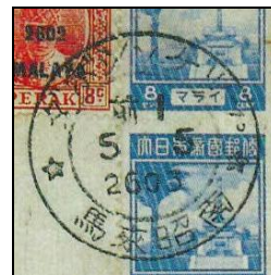
Cancel 255 Dabosingkep