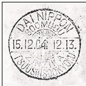
580 DN in wide outer circle