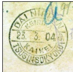
581 DN in narrow outer circle