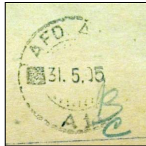
576 Discontinuous bars Department / Bureau