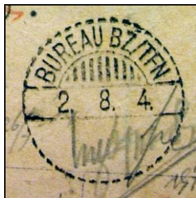
577 Bars / Open bottom