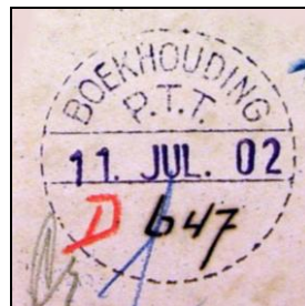
578 Name / Open bottom