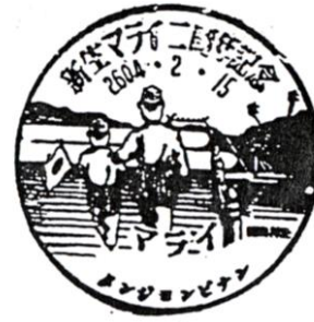
650 Tandjong Pinang